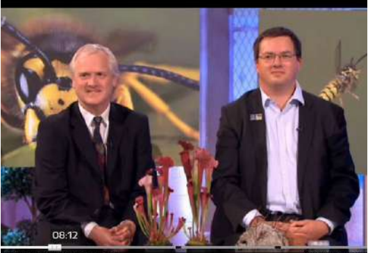
e Alan Titchmarsh Shov